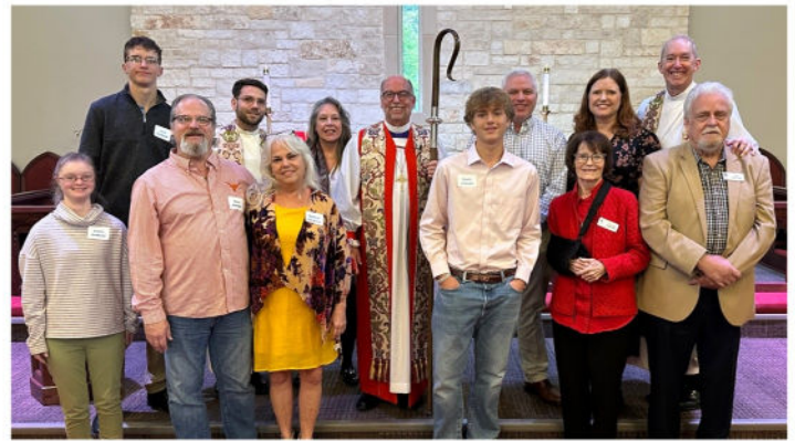
CONFIRMATION | November 17, 2024 | South Campus